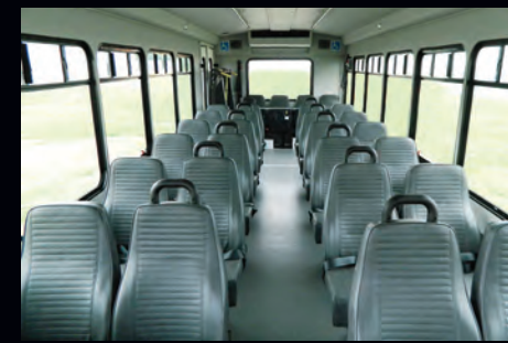
Optional mid-back seats, padded vinyl walls and ceiling, and wheelchair accessible