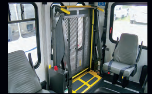
Optional ADA wheelchair lift mounted in the rear of the bus