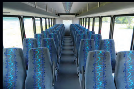
Spacious interior with high-back seats and overhead luggage racks