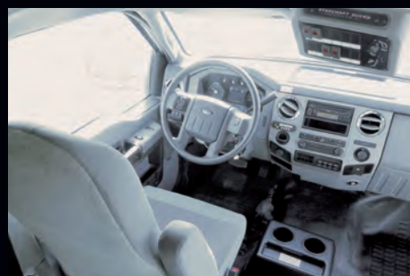
Conveniently located switches and easily-accessible driver's area