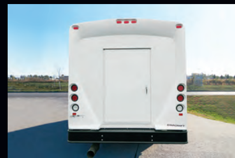
Stylish fiberglass rear cap with rear luggage access door