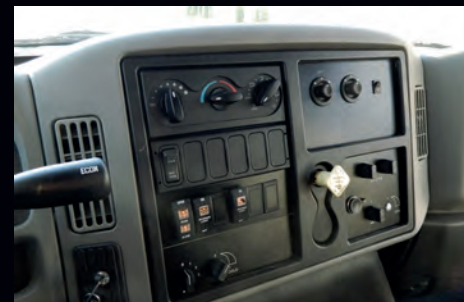
Driver's switch panel conveniently located within driver's view of the road