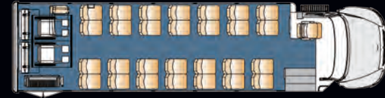
28 Passenger Plus 2 Wheelchair Positions Plus 2-Passenger Foldaway and Two 2-Passenger Flipseats