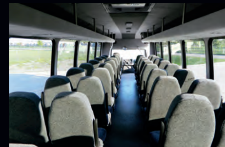
Large panoramic solid windows offer the best view for every passenger