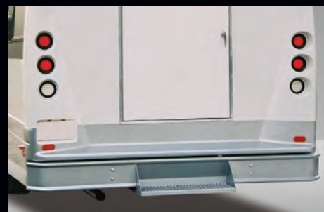
Standard fiberglass rear cap and steel rear bumper with rear step for ease of loading luggage into luggage area