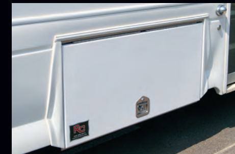
Optional skirt mounted storage pod for storage of beverages, snacks, or the sport teams extra gear