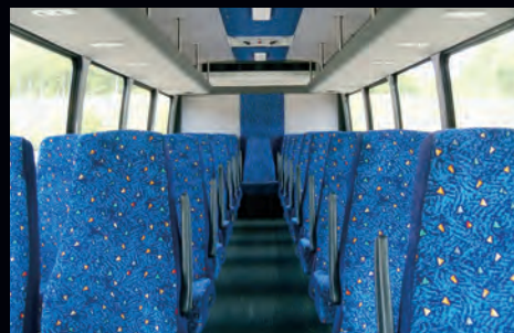
Optional 19" wide high back seats, armrests, and cloth upholstery offer a comfortable ride for all passengers