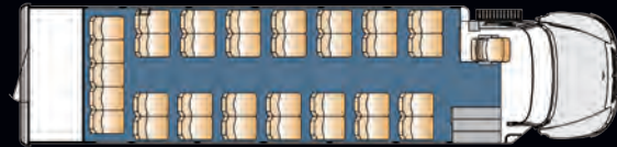
33 Passenger Plus Rear Luggage