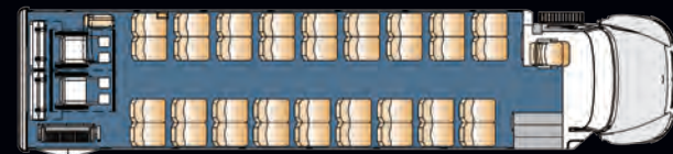
36 Passenger Plus 2 Wheelchair Positions Plus 2-Passenger Foldaway and Two 2-Passenger Flipseats